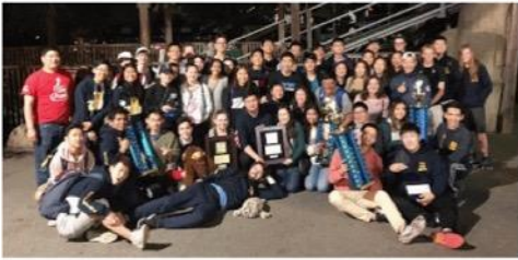
BHS Orchestra sweeps major awards at the Vancouver Festival 2018

PTSA Make an Impact Funds Raised: Target: $80K, 100% participation rate!!!